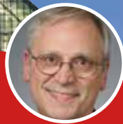
U.S. Congressman Earl Blumenauer

September 13 and September 14, 2014 in the Portland Ballroom at the Oregon Convention Center