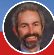
Senator Floyd Prozanski